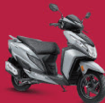
Pearl Deep Ground Gray