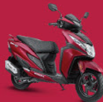
Mat Sangria Red Metallic

The New DIO 125 is available in 2 different variants